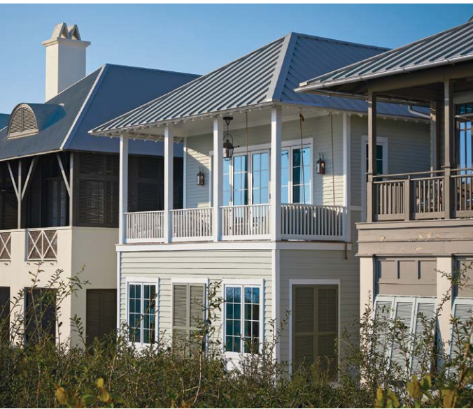
ABOVE: The home's exterior architecture recalls the design styles of the West Indies, St. Augustine, Charleston, and New Orleans.

OCEAN-INSPIRED HUES AND NATURAL TEXTURES BREATHE NEW LIFE INTO AN AIRY SEASIDE GETAWAY IN ROSEMARY BEACH