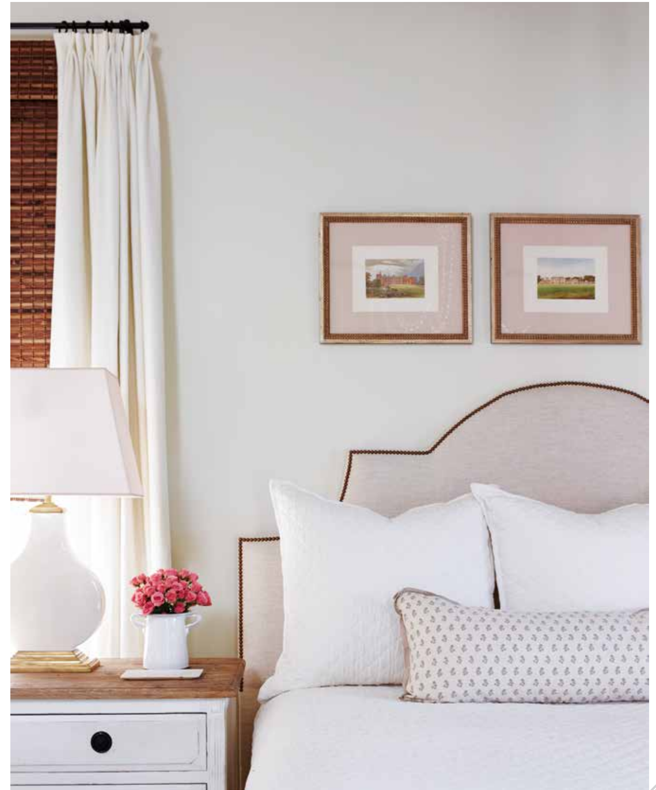
In the master bedroom, Ashley kept the palette subdued to set a tranquil tone. Serene landscape art in gilded frames lends contrast to the ecru-and-white scene. (Opposite) Original slate floors add distinctive character to the mostly white surrounds of the eating kitchen. Purchased on one of the designer's trips to Europe, the farmhouse-style breakfast table opens up to accommodate a crowd of hungry visitors. The charming Old-World accent keeps company with modern elements, like a sleek subway tile backsplash and modish pendant lights.